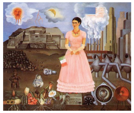
Self-Portrait on the Border Between Mexico and the United States